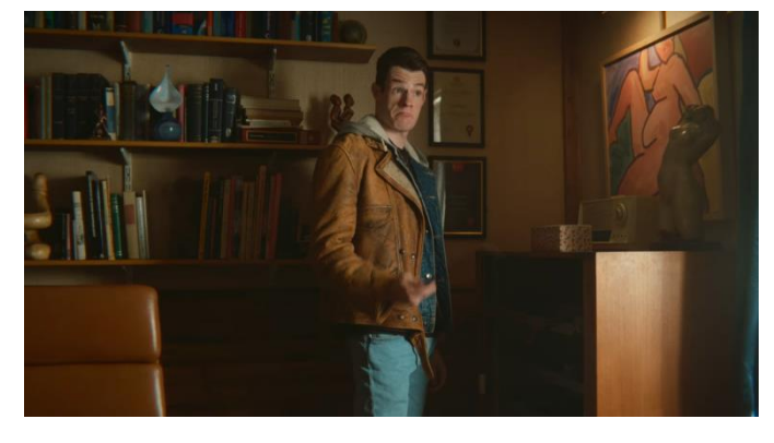
Figure 1. Adam's outfit in the first episode.

straight face remains Adam's most common facial expression; he rarely smiles or shows emotions apart from aggression. The emotional detachment and distance this portrayal conveys is supported by bland and mostly gray clothing paired with the brown leather jacket that Adam wears regularly (fig. 1). When compared to other characters who at least wear one colorful piece of clothing – such as the school's red letterman jacket that the captain of the